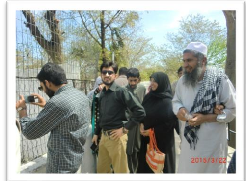
Recreational tour to Islam Abad for PWDs